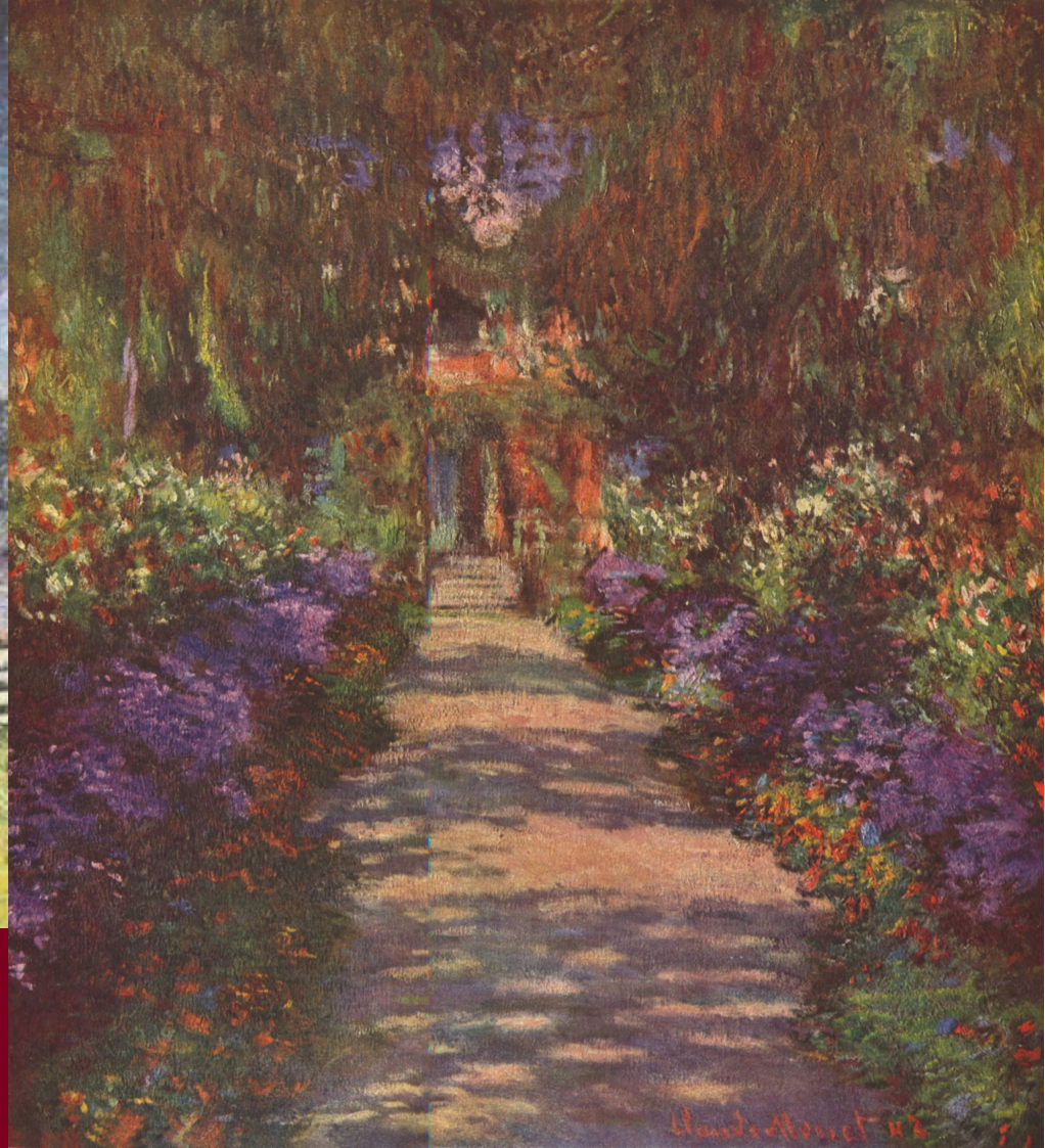
A pathway in Monet's garden Giverny