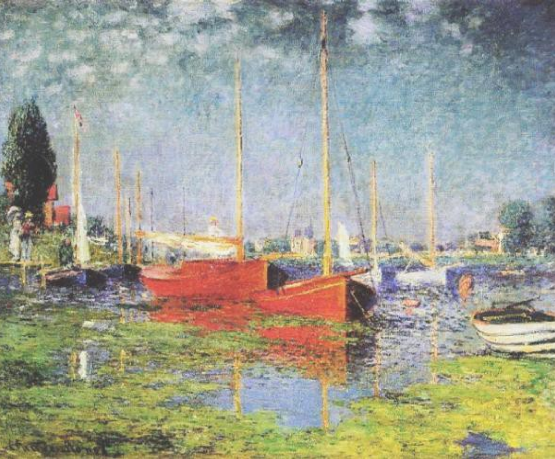
Les Bateaux rouges, Argenteuil